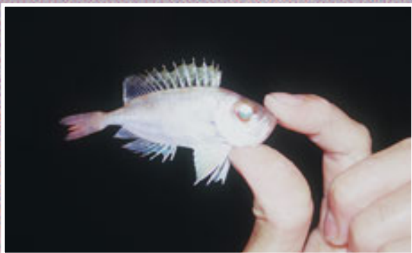
Above: One of the little red “bullseyes” taken at night on a bait jig.

Right: Ben with a large golden trevally taken on a purple/gold Pakula while trolling around the schools of little red fish known as ‘bullseyes’. The trevally, which were feeding on the balled up bullseyes, were prolific throughout January and February in the area just to the south of Rooney’s Point. The author was hooked up to a couple of these XOS trevally on fly and spin gear, but both fish proved too big for the light tackle, busting off in the end.